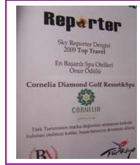
REPORTER MAG. - BEST SPA HOTEL