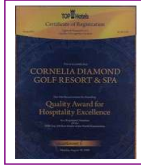
TOPHOTELS - AWARD for EXCELLENCE