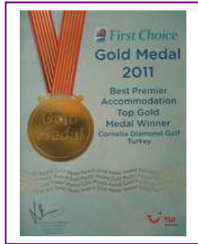
FIRST CHOICE - GOLD MEDAL