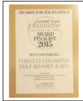
CONDE NAST JOHANSENS