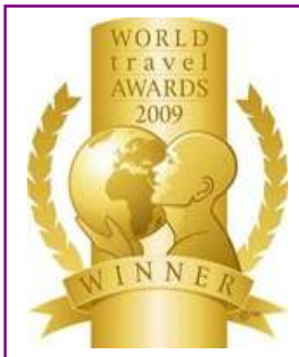
WTA - Europe's Leading Golf Resort