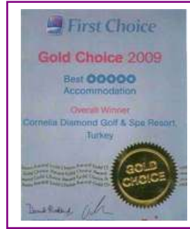
FIRST CHOICE - GOLD CHOICE