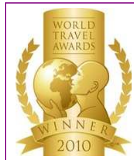
WTA - World's Leading All-Inclusive Golf Resort