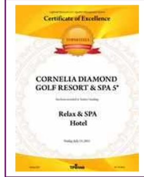
TOPHOTELS – Turkey's Leading Relax & SPA