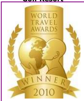
WTA - Europe's Leading Luxury Resort