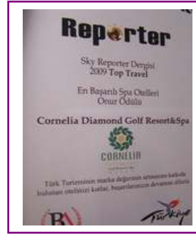
REPORTER MAG. - BEST SPA HOTEL