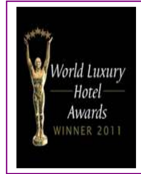
WORLD LUXURY - BEST LUXURY GOLF RESORT