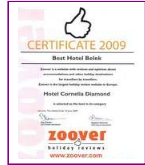
ZOOVER - BEST HOTEL BELEK