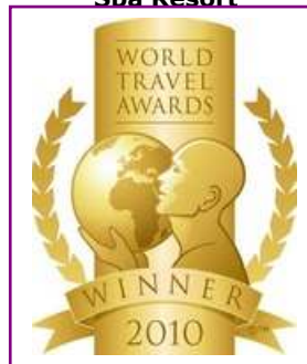
WTA - Europe's Leading Spa Resort