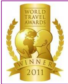
WTA - Europe's Leading Luxury Resort