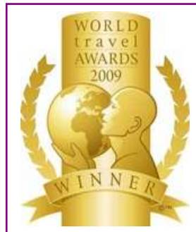
WTA - Turkey's Leading Spa Resort