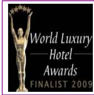
WORLD LUXURY - LUXURY GOLF RESORT