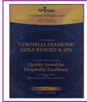
TOPHOTELS - AWARD for EXCELLENCE