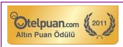
OTEL PUAN GOLD