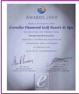
AWARD for EXCELLENCE