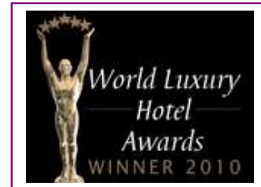
WORLD LUXURY - BEST LUXURY GOLF RESORT