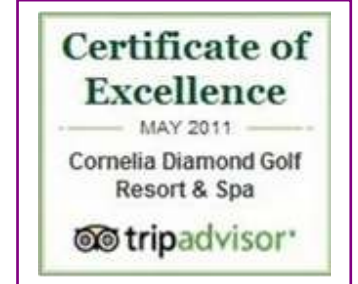
TRIP ADVISOR - CERTIFICATE of EXCELLENCE