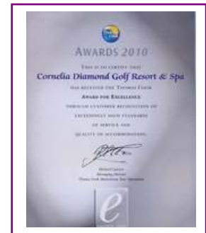
MARK for EXCELLENCE