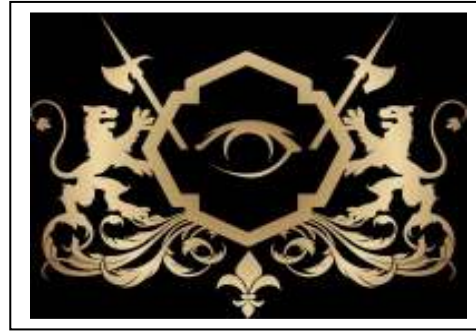
EUROPEAN BEST SPORT HOTEL 2012