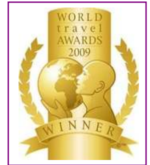
WTA - Europe's Leading Spa Resort