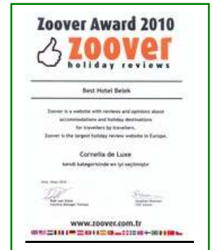
ZOOVER - BEST HOTEL BELEK