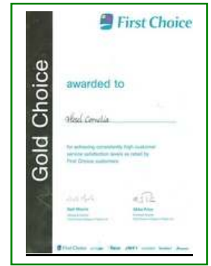
FIRST CHOICE - GOLD CHOICE