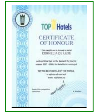
TOP 100 BEST HOTELS - CERT. OF HONOUR