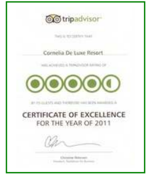
TRIPADVISOR – CERTIFICATE of EXCELLENCE