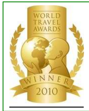
WTA – Europe's Leading Golf Resort