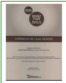
OTEL PUAN - BRONZE AWARD