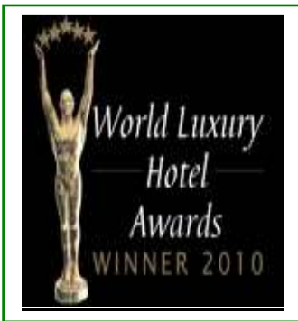
BEST LUXURY COASTAL HOTEL