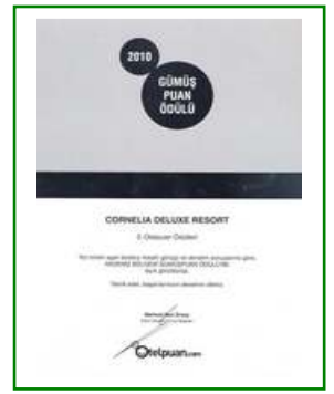
OTEL PUAN – SILVER AWARD