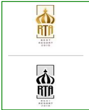
RUSSIAN TRAVEL AWARDS – Best Resort