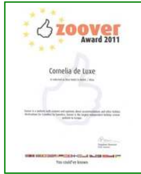
ZOOVER – BEST HOTEL BELEK