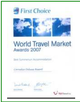
FIRST CHOICE - WORLD TRAVEL MARKET AWARDS