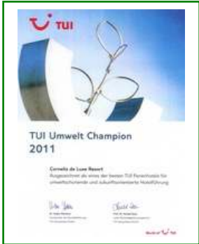
TUI – UMWELT CHAMPION