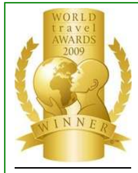
WTA - Turkey's Leading Golf Resort