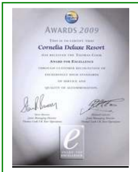
THOMAS COOK - AWARDS for EXCELLENCE