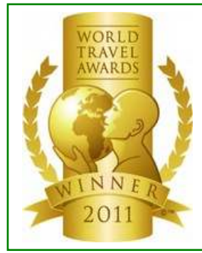
WTA – Turkey's Leading Golf Resort