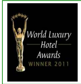
BEST LUXURY COASTAL RESORT