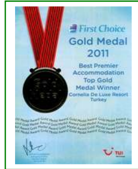
FIRST CHOICE – TOP GOLD MEDAL