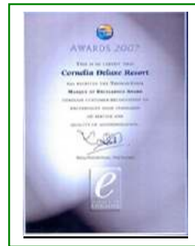
THOMAS COOK - MARQUE of EXCELLENCE