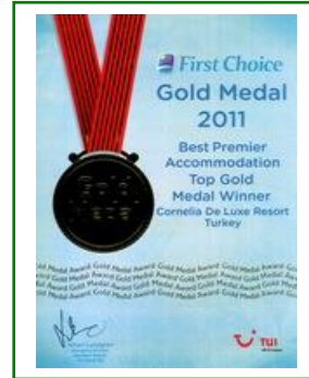
FIRST CHOICE – TOP GOLD MEDAL