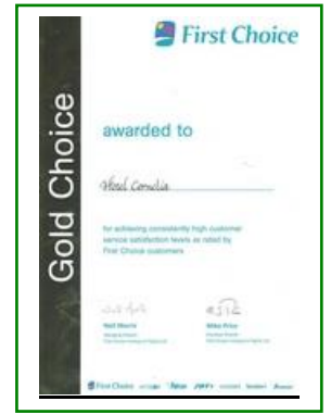
FIRST CHOICE - GOLD CHOICE