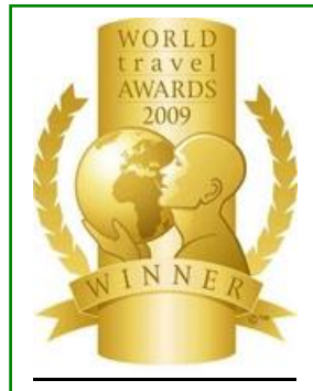
WTA - Turkey's Leading Golf Resort