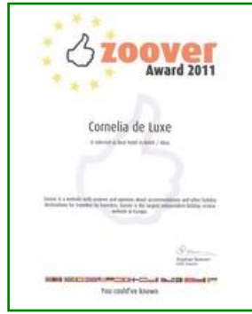
ZOOVER – BEST HOTEL BELEK