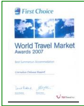
FIRST CHOICE - WORLD TRAVEL MARKET AWARDS