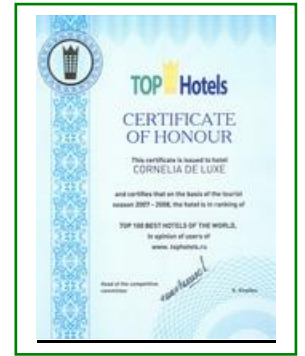
TOP 100 BEST HOTELS - CERT. OF HONOUR