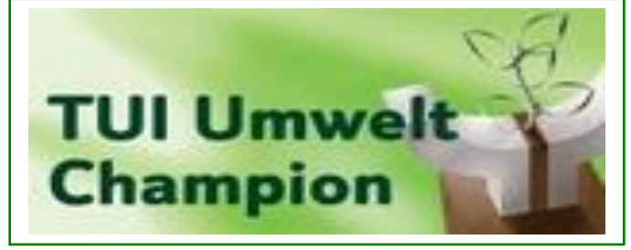
TUI – Environmentally Friendly TOP 100 Hotels Worldwide