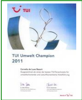
TUI – UMWELT CHAMPION