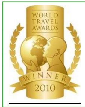
WTA – Europe's Leading Golf Resort