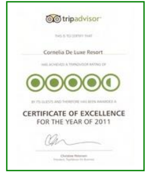
TRIPADVISOR – CERTIFICATE of EXCELLENCE