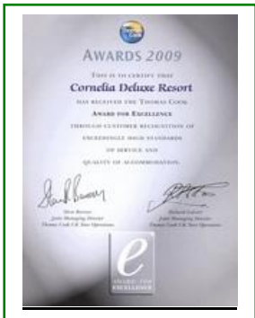
THOMAS COOK - AWARDS FOR EXCELLENCE