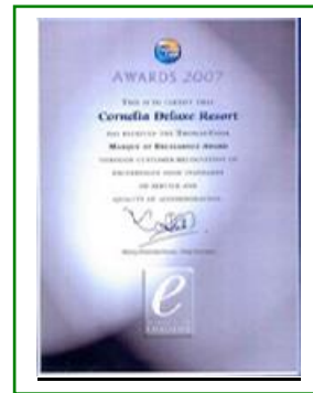
THOMAS COOK - MARQUE OF EXCELLENCE