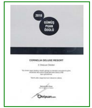
OTEL PUAN – SILVER AWARD