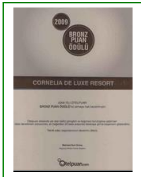
OTEL PUAN - BRONZE AWARD