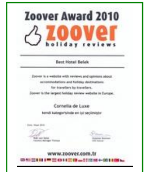
ZOOVER - BEST HOTEL BELEK